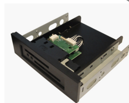
Dimensjon: Brakett/Deksel (2,5" / 3,5")